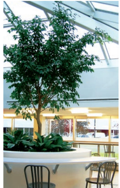
Moore Park Plantscapes