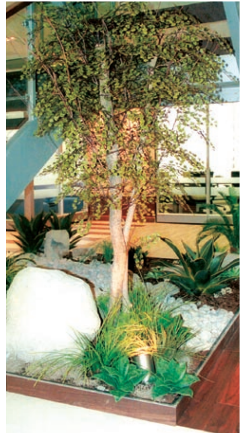
Plant Maintenance Group

Toronto Congress Centre, 650 Dixon Road Canada's International Horticultural Lawn and Garden Trade Show and Conference. New at Congress this year is the Green Forum, featuring environmental stewardship seminars and innovative green products. Visit www.locongress.com for more information.