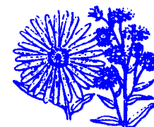
Aster frikartii flowers and how they grow: lavender-blue with yellow centers.